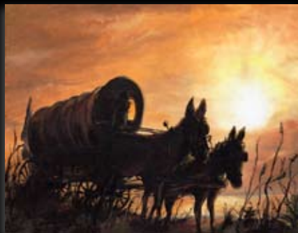
A DAYS JOURNEY