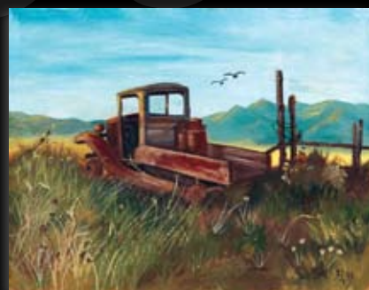
THERE IS A SEASON