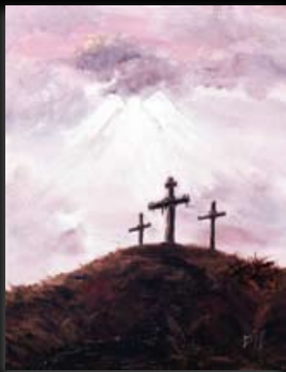
CROSSES ON HILL