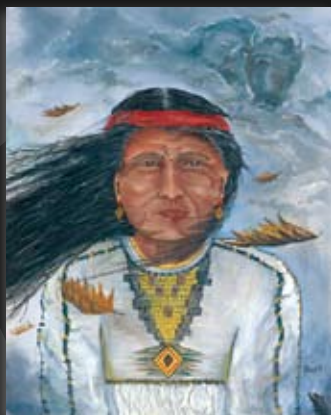
CHERISH THE WISDOM