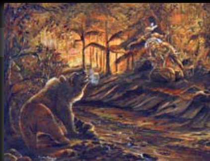
FACES OF THE FOREST