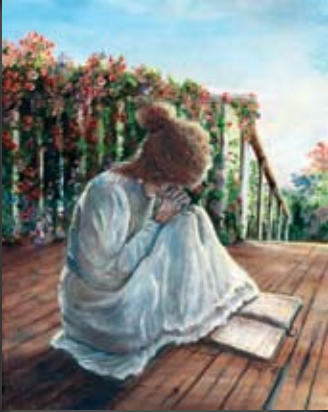
SHE PRAYS FOR ME