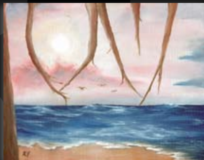
FIND THE LOVE