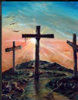
I LOVE YOU