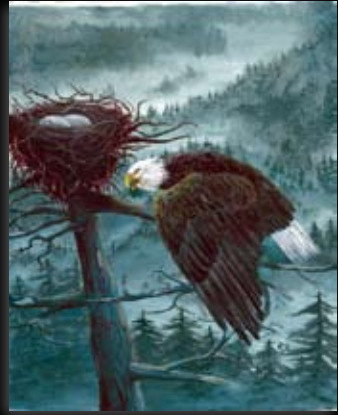
PROTECT YOUR OWN