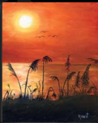
THE SUN'S CARESS