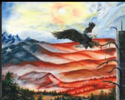
911 WE REMEMBER