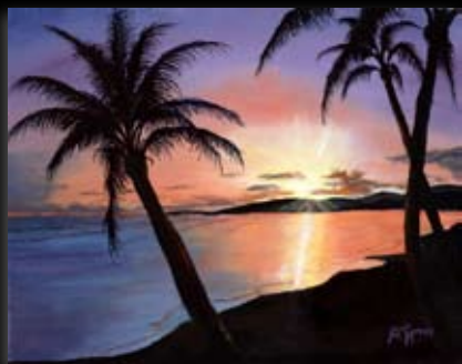
IT'S ALL GOOD